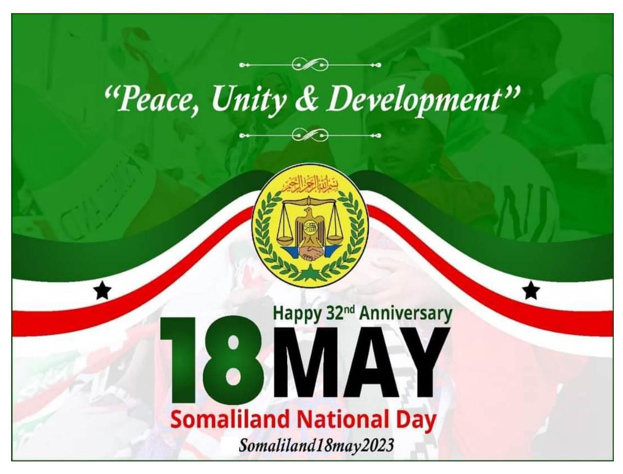
Guul iyo Gobanimo